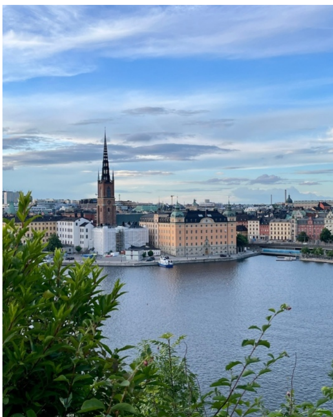
View of Old Town

As we strive to improve and tweak our summer programme, we ask all our students to give us feedback through an anonymous survey. We use all constructive feedback to make the following year even better! Here are most of the answers on the overall impression of the programme 2024.