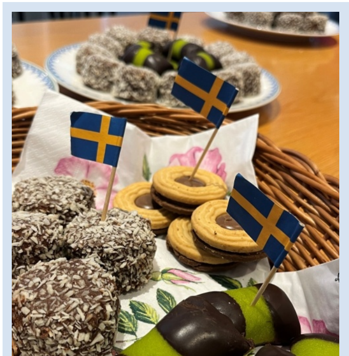
Photo: Swedish fika

If you have any questions about our Summer programme, don't hesitate to contact us using the following email: summer@juridicum.su.se