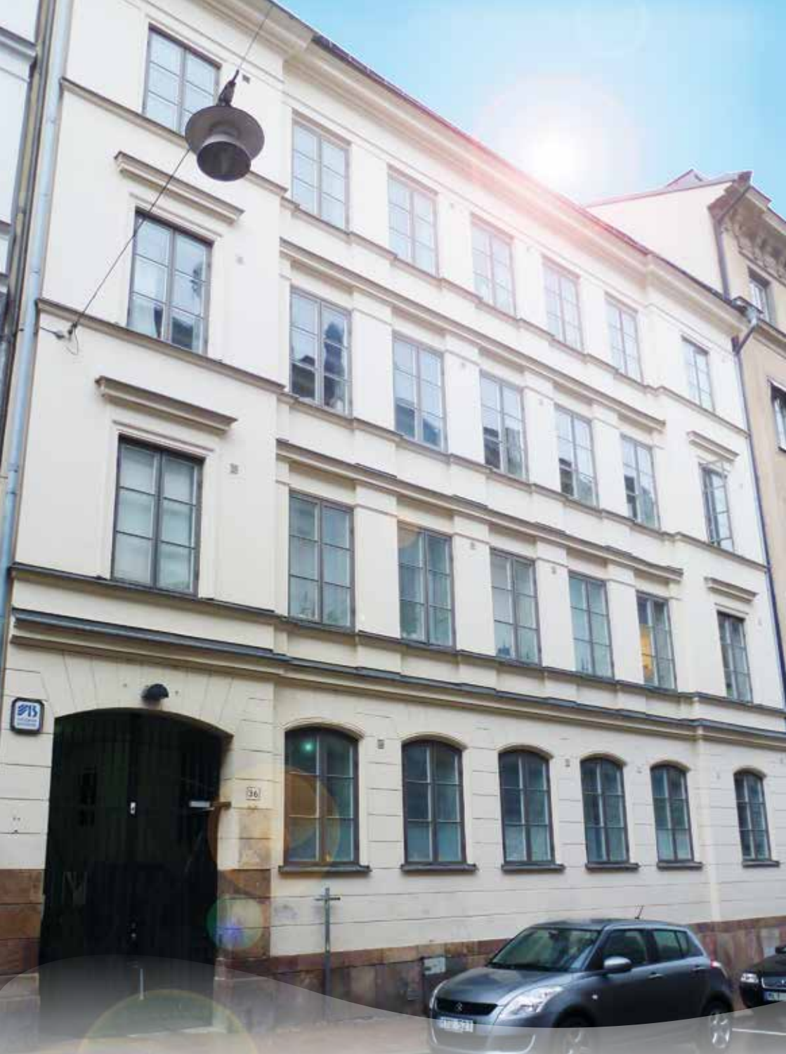
Guest researcher accommodation at Kammakargatan 36B.