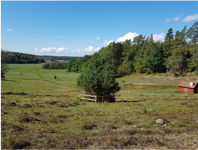
Fig. 2 The future of semi-natural grasslands? As part of an experiment on litter decomposition initiated in 2004, small grazing enclosures were established in a semi-natural grassland at Långmaren, c. 100 km south of Stockholm, Sweden. After the experiment was completed, the land manager decided to maintain some of the enclosures to show visitors what would happen if grazing would cease. The photo was taken in 2018, thus showing the encroachment after 14 years of abandonment of grazing. This site harbors an exceptional local-scale plant species richness, a rich fauna of butterflies, and several Red Listed insects, for example the endangered drum grasshopper ( Psophus stridulus ). Without grazing, the whole area would soon turn into a species-poor, dense forest. The photo illustrates that a time-period of 100 years may be too conservative for estimating extinction rates in semi-natural grasslands.

after abandonment of traditional management, 100 years, is reasonable for vascular plants, it is likely to be too long for short lived organisms such as insects (Fig. 2). If, for example, 10 years was chosen instead, that would increase the extinction rate by one order of magnitude.