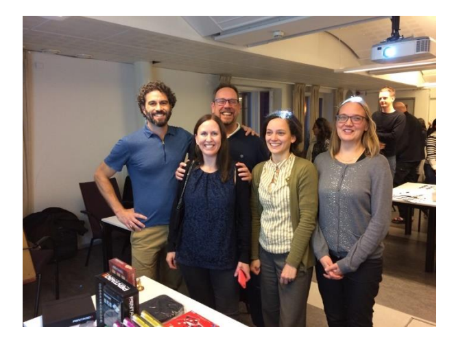
At the annual staff conference. October 2016.

Staff meetings were scheduled every third week during the autumn and spring term. The chair position rotated between the meetings.