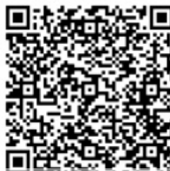
LL.M. programmes at SULaw