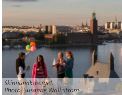
Skinnarviksberget.