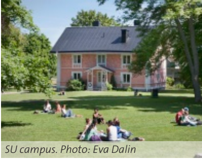
SU campus.