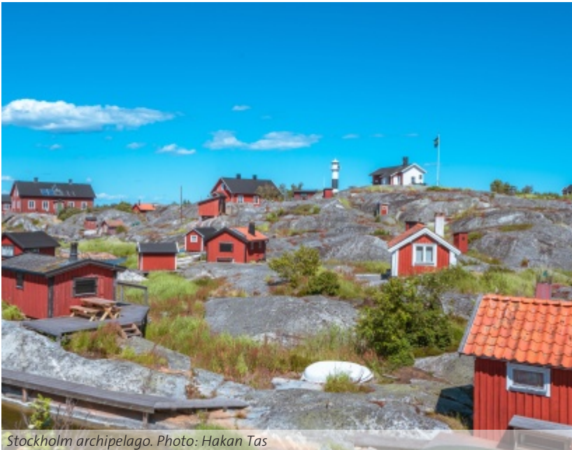
Stockholm archipelago.