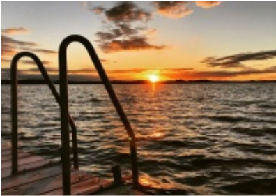
Summer in Stockholm.