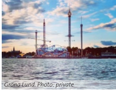
Gröna Lund.