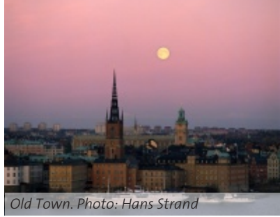
Old Town.