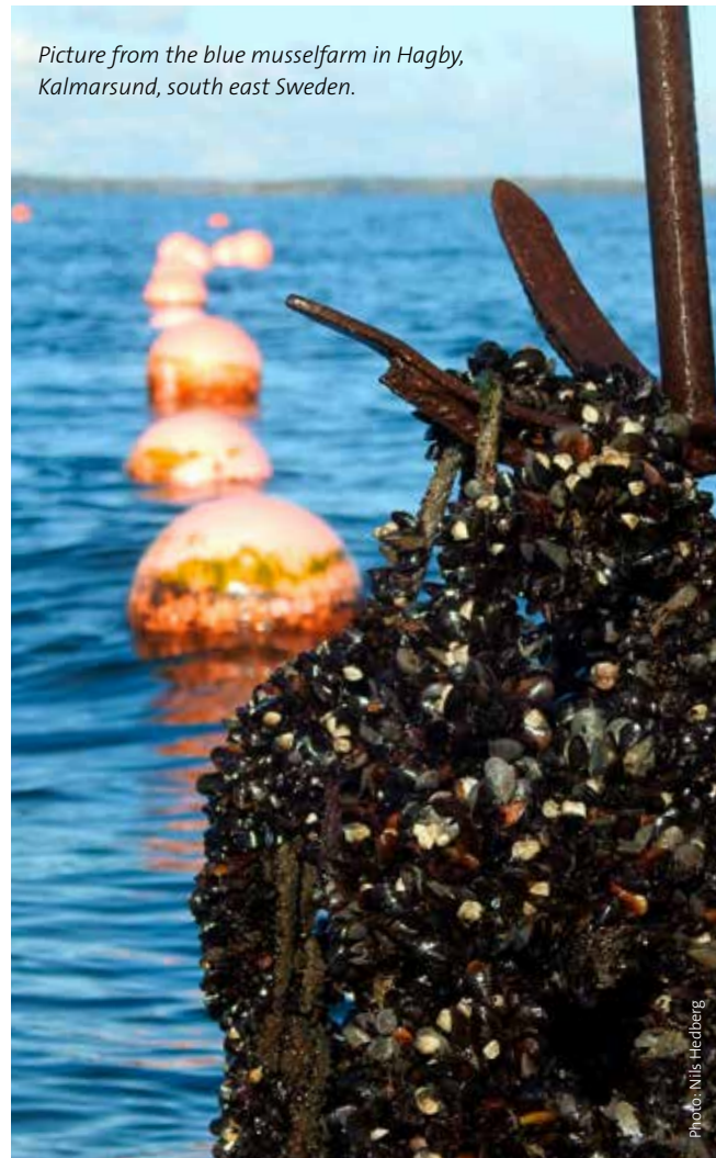
Picture from the blue mussel farm in Hagby, Kalmarsund, south east Sweden.

The effect of mussel farming on benthic habitats will also depend on the specific characteristics of the area and on the type of habitat. Some coastal benthic communities (e.g. soft bottoms) are more adapted to cope with heavy sedimentation while for others, i.e. hard bottom communities, algal and seagrass beds, it could be detrimental. One habitat that may be particularly sensitive is eelgrass ( Zostera marina ) meadows (Wisehart et al. 2007, Tallis et al 2009, Vinther et al. 2007). If projecting for development of mussel farming, mapping of bottom habitats needs to be included in order to assess the potential effects on the local environment.