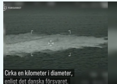
Aerial view of methane leakage from Nord Stream.

The leakage of methane gas from the Nord Stream pipelines has a large local effect on ocean chemistry, but the global climate impact is likely to be small. This according to geochemist Volker Brüchert at Stockholm University.