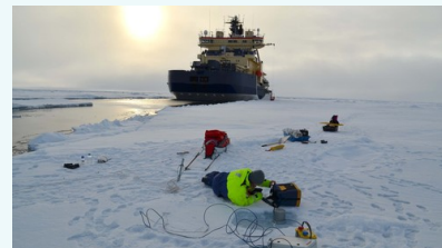
Sonja Murto performing on-ice surface atmosphere gas exchange sampling during SAS2021.

To explain the reasons for the rapid warming in the Arctic, measurements of the atmosphere are needed. On the icebreaker Oden, researchers within the ACAS project have developed an atmospheric observatory to be able to study factors such as changes in clouds and the interactions between the surface and the atmosphere.