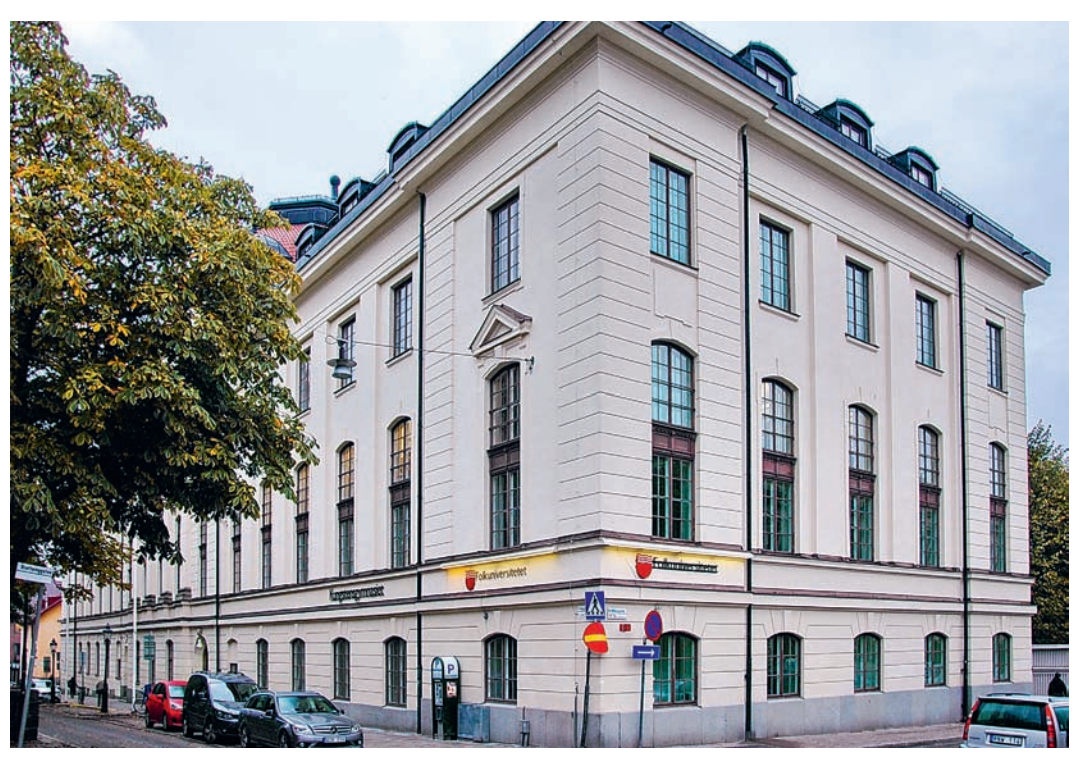
Kungstensgatan 45, now used by Folkuniversitetet.

with the first of the four phases I will describe below. In 1973, I was employed as an assistant and started my doctoral studies. From my doctoral defence in 1983 and onward, I have been employed in different positions at the Department. Thus, the position of this text's author moves from the curious investigator of what was prior to my own memories (pre-1971) to the perspective of the 1970s' post-graduate stu-