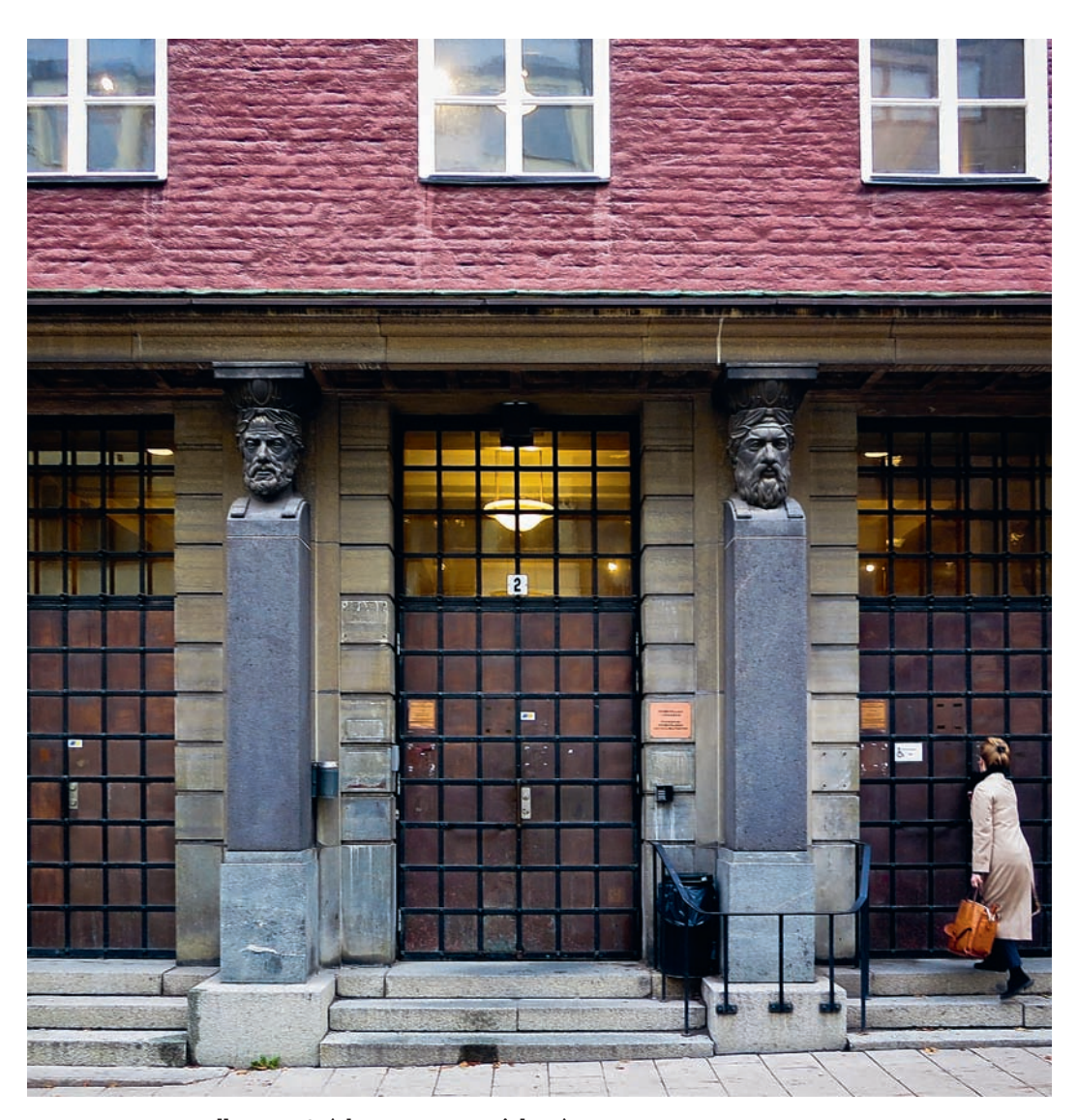
Entrance to Norrtullsgatan 2.