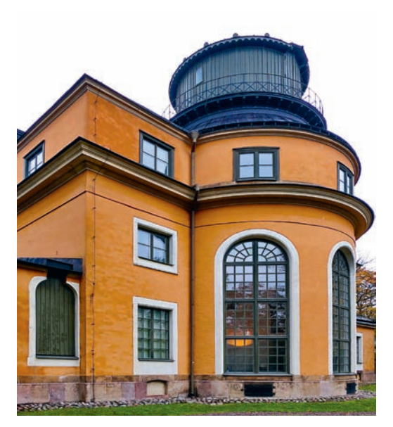
The Old Observatory on the hill Observatoriekullen.

when he took charge of the Department's leadership. More liberal university entrance requirements and a removal of the restrictions concerning the number of students admitted had caused an increase in student numbers from about eighty in the mid-1960s to over eight hundred four years later (Helmfrid & Sporrong n.d.). Many students did like I did in 1971, lining up on the street outside a popular department to register for courses a few days before they started. Regardless of all other planning problems, the question of premises for teaching and an increasing demand for