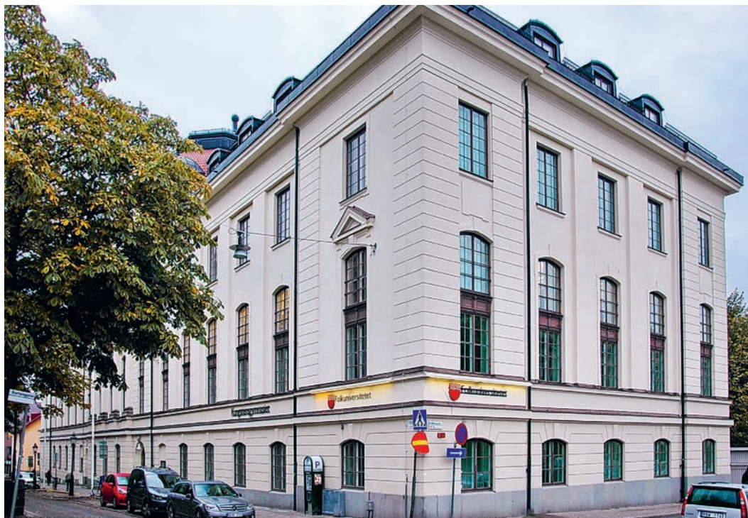
Kungstensgatan 45, now used by Folkuniversitetet.

with the first of the four phases I will describe below. In 1973, I was employed as an assistant and started my doctoral studies. From my doctoral defence in 1983 and onward, I have been employed in different positions at the Department. Thus, the position of this text's author moves from the curious investigator of what was prior to my own memories (pre-1971) to the perspective of the 1970s' post-graduate stu-