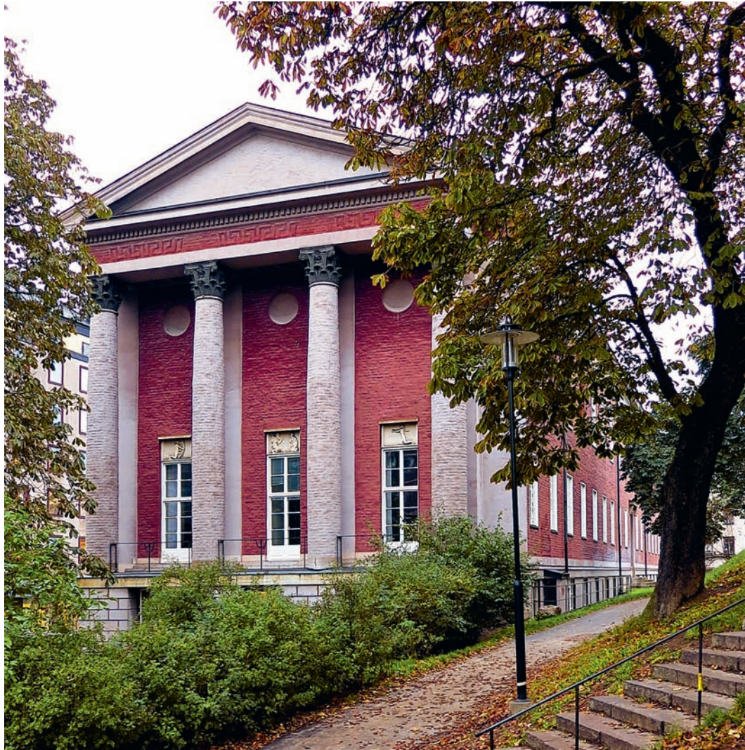
Norrtullsgatan 2, presently referred to as Studentpalatset (the Student Palace) and offering study places in the city centre for students.