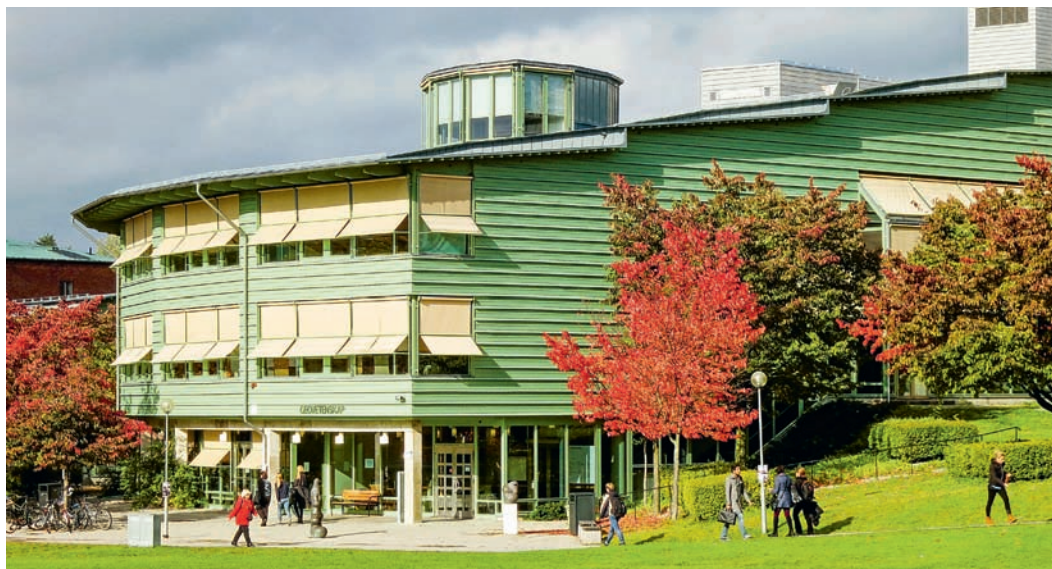
The Geo Building at Frescati, originally shared by human and natural geographers and geologists.

cross fertilisation at the postgraduate level between departments.