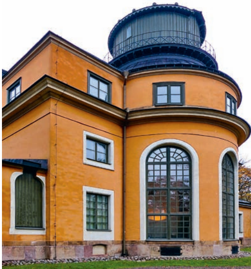
The Old Observatory on the hill Observatoriekullen .

when he took charge of the Department's leadership. More liberal university entrance requirements and a removal of the restrictions concerning the number of students admitted had caused an increase in student numbers from about eighty in the mid-1960s to over eight hundred four years later (Helmfrid & Sporrang n.d.). Many students did like I did in 1971, lining up on the street outside a popular department to register for courses a few days before they started. Regardless of all other planning problems, the question of premises for teaching and an increasing demand for