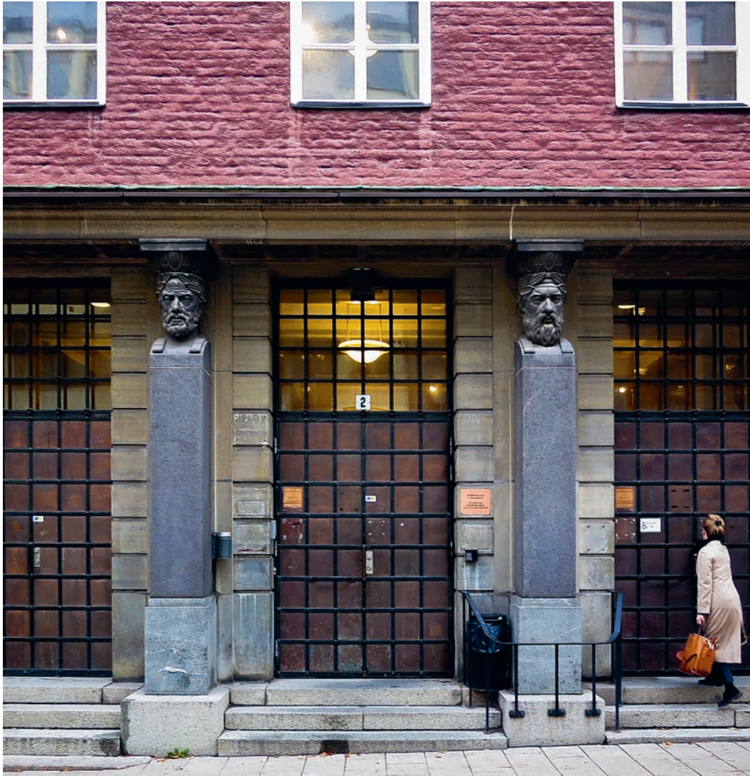
Entrance to Norrtullsgatan 2.