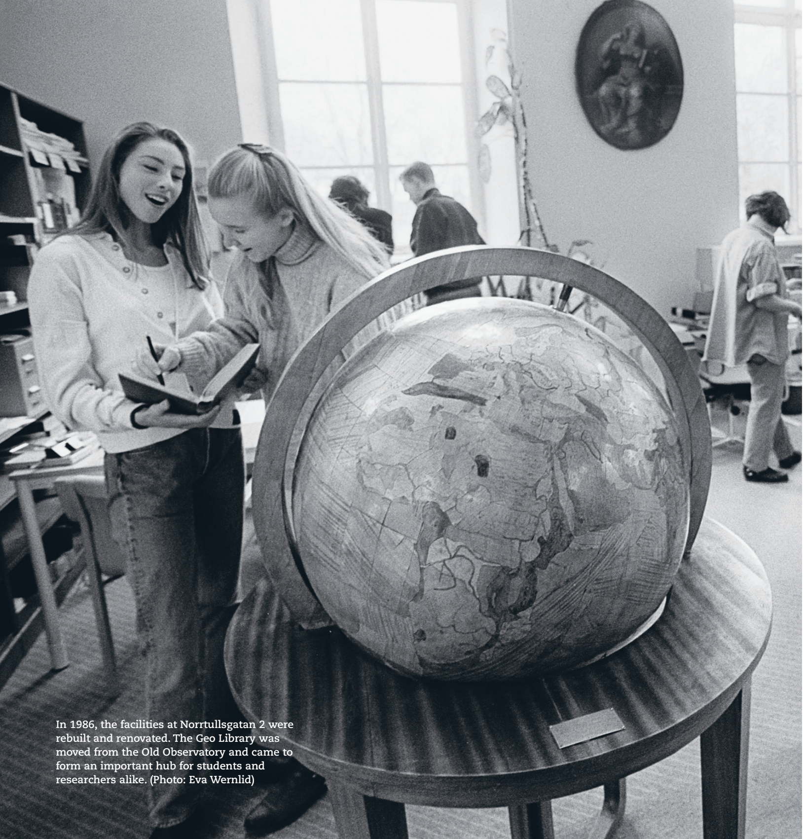
In 1986, the facilities at Norrtullsgatan 2 were rebuilt and renovated. The Geo Library was moved from the Old Observatory and came to form an important hub for students and researchers alike.