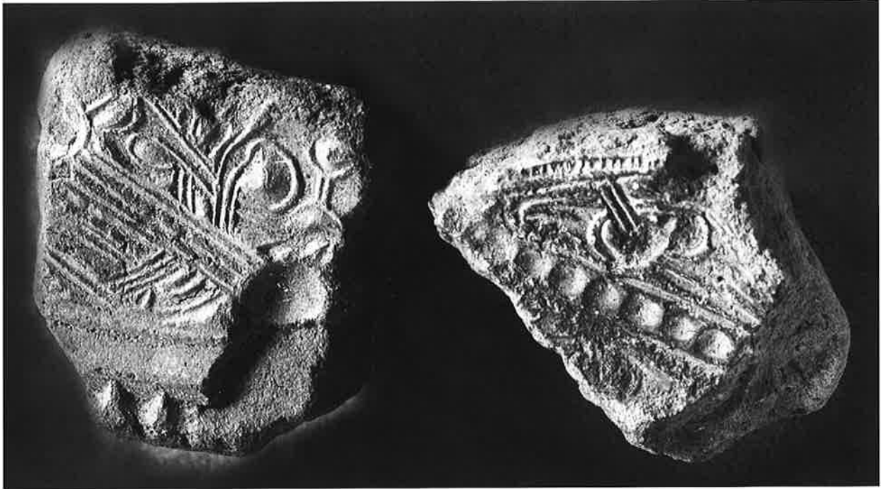
Figure 3. Two of the mould fragments for producing oval brooches (P25) from the workshop at Stora Förvar.

circumstances. But a letter written by the excavator describes one of the querns found in the cave mouth, at a depth of 60–80 cm in the cultural layer (ATA letter Kolmodin to Lindström 9/8 1888; SHM 8473/D find 3; there are two querns listed under the inventory number 8473 for Kolmodin's excavation, and a third stone came from one of Stolpe's expeditions in 1891–92). This is a depth where several other Iron Age finds occurred (ATA letter, Kolmodin). The querns are of granite, one of them possibly being eye-granite, and the stone is from Småland, which is interesting.