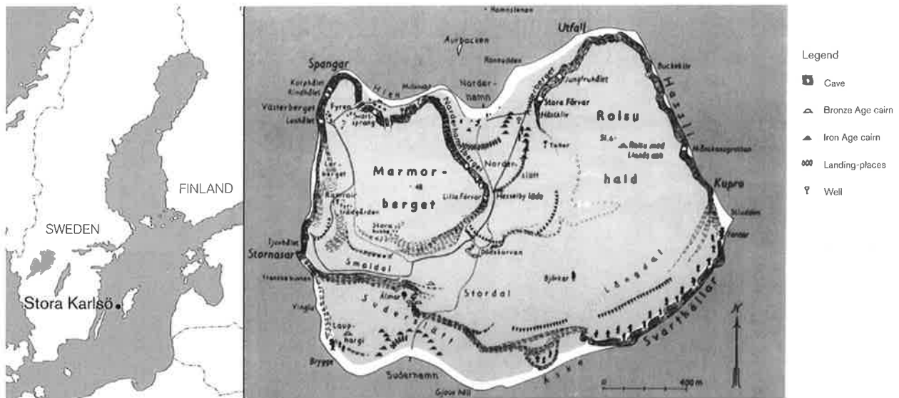
Figure 1. Left: The island of Stora Karlsö, situated 6 km from the west coast of Gotland. Map: Liselotte Bergström. Right: The topography and placenames of Stora Karlsö, as illustrated on the map produced by the island's hunting and animal conservation society (Karlsö Jagt och Djurskyddsörening AB).

been located on one of a row of terraces that are still visible in the landscape. Such terraces were constructed as foundations for houses. This is a house-building tradition that is well known from the Iron Age in Central and Northern Sweden (Göthberg 1995:92; Liedgren 1995:131).