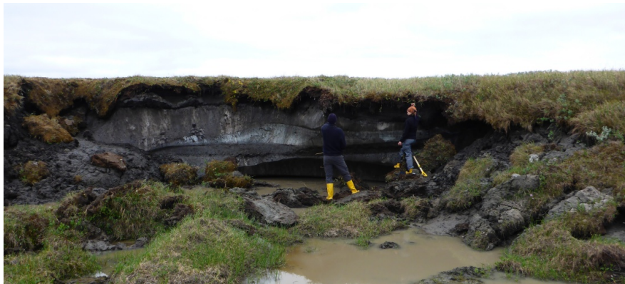
Researchers surveying thawing permafrost on Kurunghakh Island, Lena Delta, Siberia (2016).